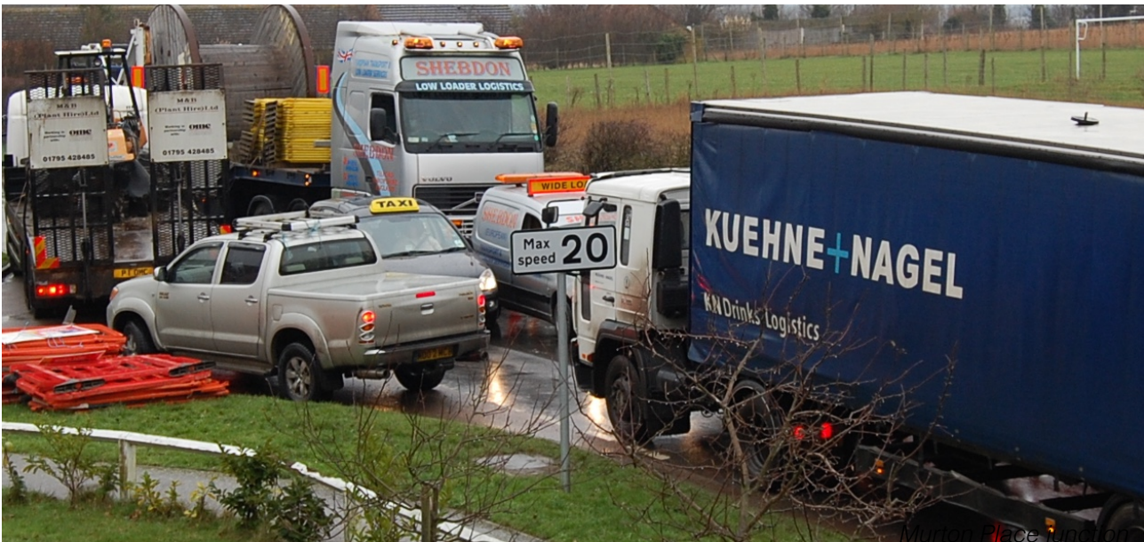
Above - routine traffic chaos at Murton Place on Seasalter Road caused by the London Array development.